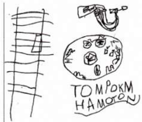
I will like to play Ninja Turtles and Power Rangers on the oval. Tahir Syed